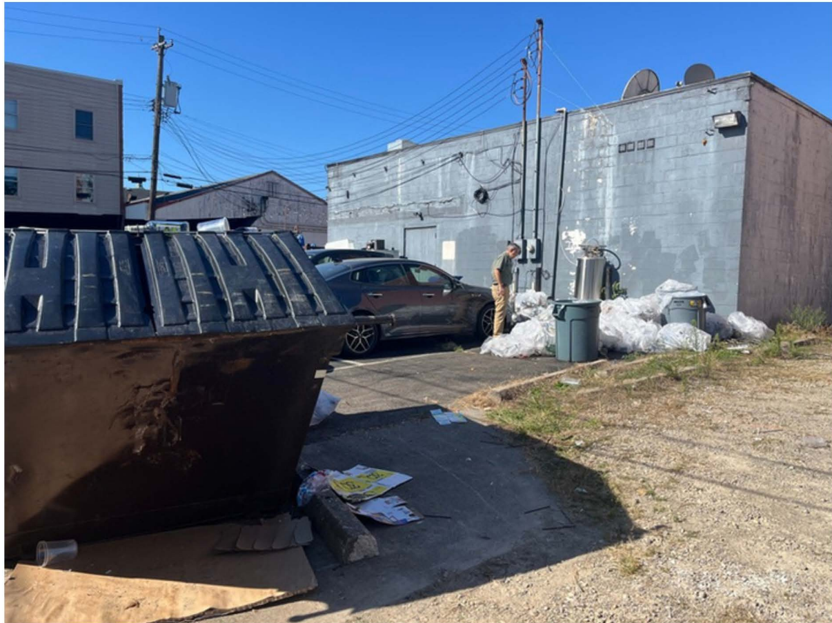
Behind The Woods