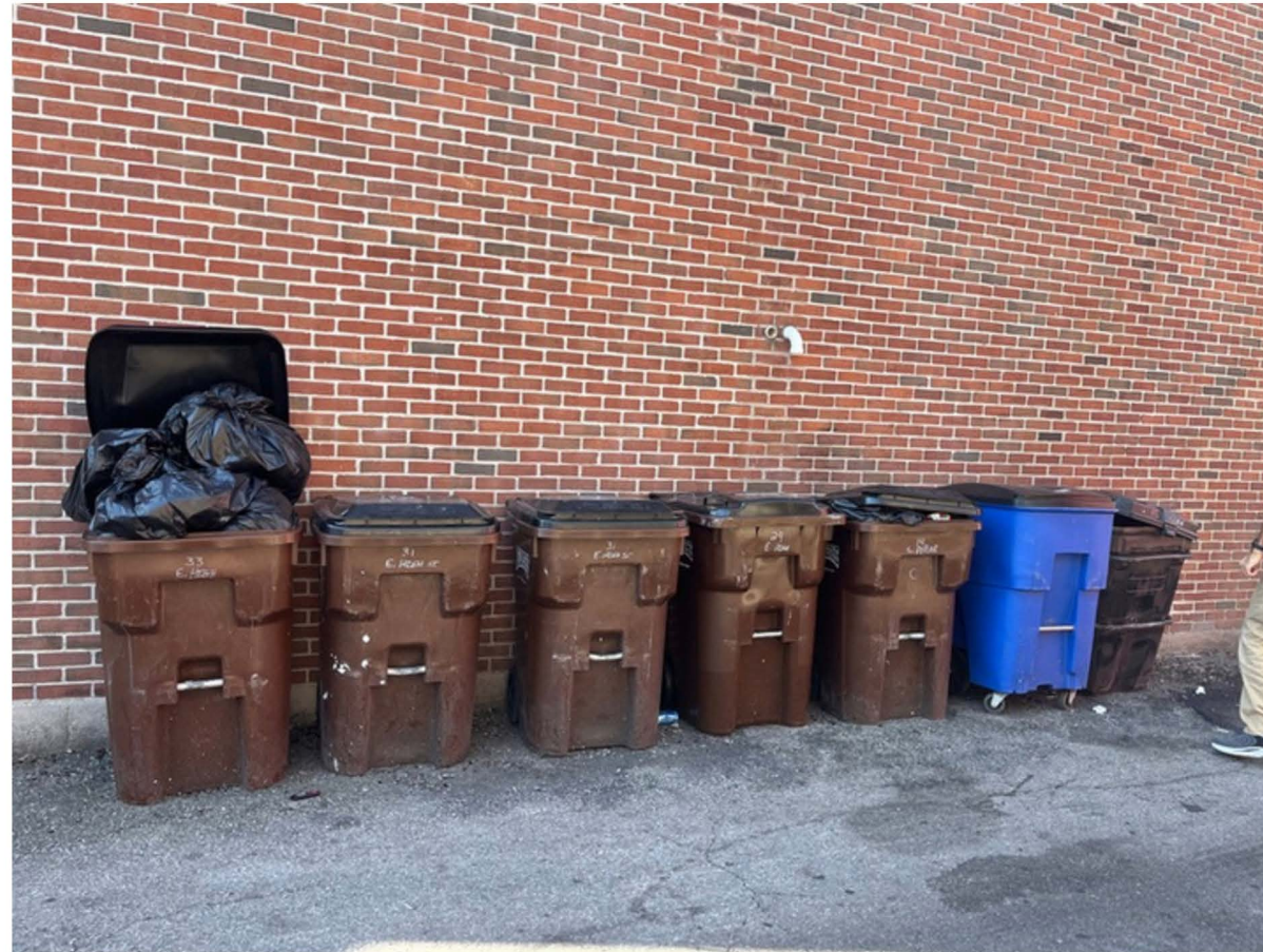
Alley behind CJ's